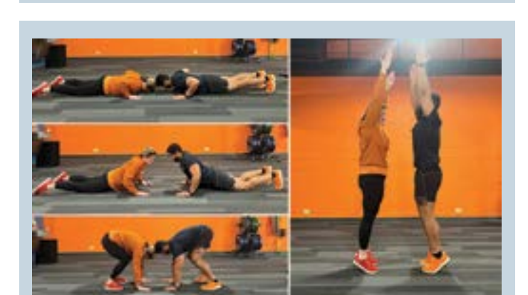
Orange Shoe Fitness Park Ridge held a Burpees Challenge to raise money to support children with cancer.