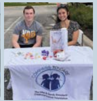
Goldfish Swim School Park Ridge chose Compass to Care's kids as the beneficiary of their Block Party.